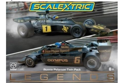
C4684A Ronnie Peterson Lotus Twin Pack