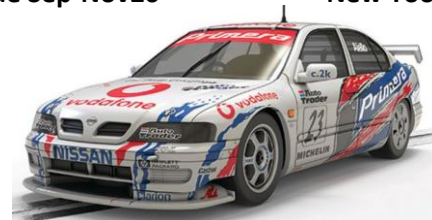
C4686 Nissan Primera #23 BTCC 1999