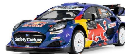
C4654 Ford Puma Rally #13 Monte Carlo