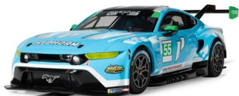
C4709 Ford Mustang GT3 #55 2024