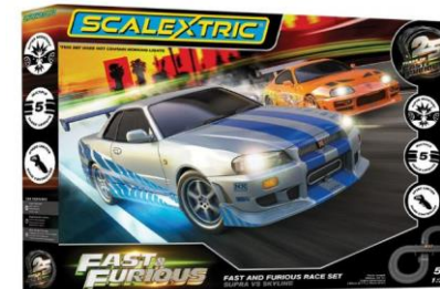
C1465 Fast and Furious 25 Years Set