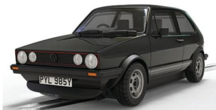
C4692 Volkswagen Golf MK1 GTI