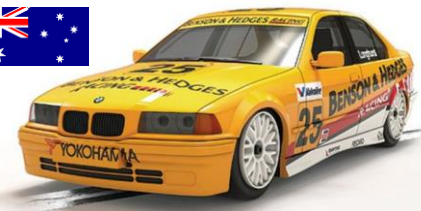
C4690 BMW E36 318i #25 1995 Longhurst