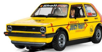
C4625 Volkswagen Golf MK1 #16