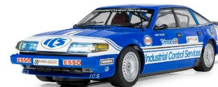
C4634 Rover SD1 #7 BTCC 1984 Rouse