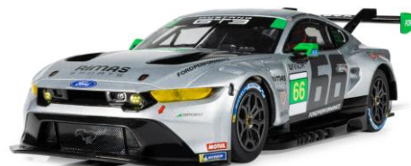
C4662 Ford Mustang GT3 #66 2025