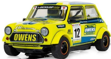
C4635 Mini Miglia #12 Endaf Owens