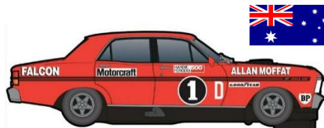
C4702 Ford XY Falcon GTHO Phase III #1D 1972 Bathurst Allan Moffat