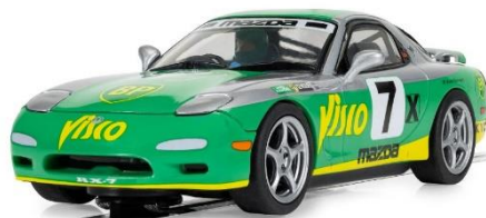
C4652 Mazda RX7 FD #7 12hr Bathurst '94