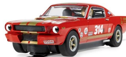
C4658 Shelby GT350H #314 Red and Gold