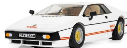
C4631 Lotus Esprit Turbo James Bond