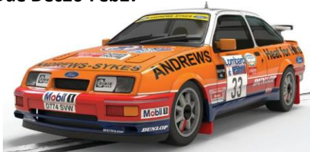
C4685 Ford Sierra RS Cosworth #33