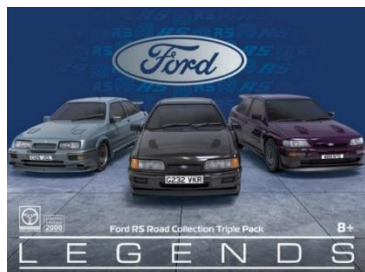
C4666A Ford RS Road Collection Triple Pack