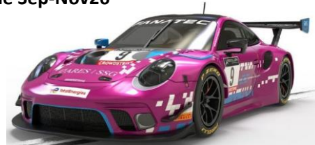
C4710 Porsche 911 GT3 R #9 Spa 2022