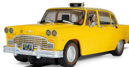
C4606 Checker Taxi Cab James Bond