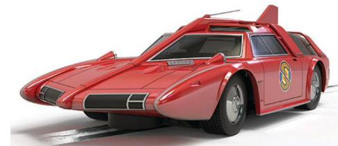
C4680 SPC Captain Scarlet Chrome