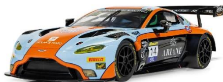
C4655 Aston Martin GT3 B12Hr 2025