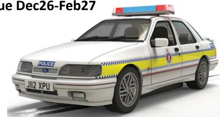
C4660 Ford Sierra Sapphire Police