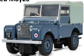
C4661 Land Rover Series 1 RAF