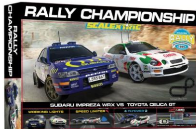
C1463 Rally Championship Retro Set