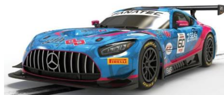
C4711 Mercedes AMG GT3 #60 Spa 2024