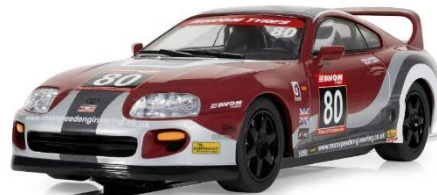
C4656 Toyota Supra #80 British GT 2003