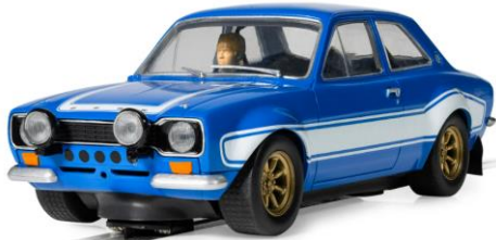
C4677 Ford Escort MK1 Fast & Furious 6