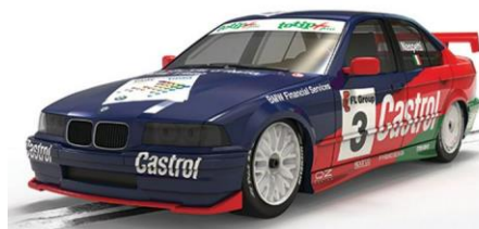
C4673 BMW E36 320i #3 Italy 1999