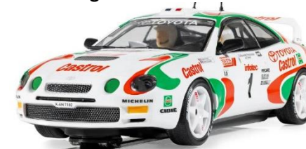
C4665 Toyota Celica GT-Four #1 WRC '95