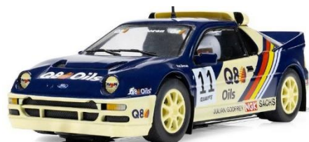
C4667 Ford RS200 #11 Pat Doran