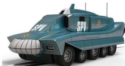
C4672 SPV Captain Scarlet Chrome