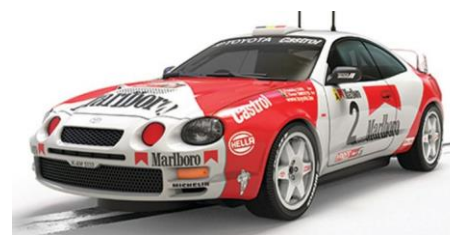
C4683 Toyota Celica GT-Four #2 Ypres