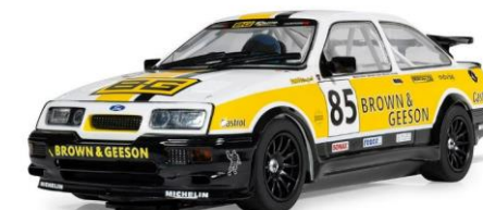
C4628 Ford Sierra RS500 #85 YTCC '24