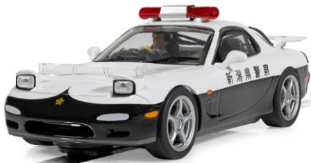
C4681 Mazda RX7 FD Police Edition