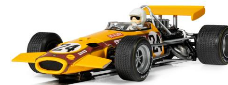
C4712 Brabham BT26A #24 SA GP 1970