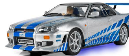
C4674 Nissan R34 GT-R 2 Fast 2 Furious