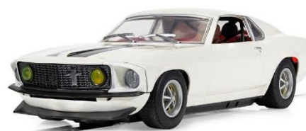
C4664 Ford Mustang Fast And Furious 6