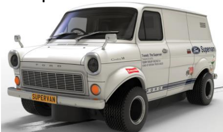
C4650 Ford Transit Mk 1 Supervan