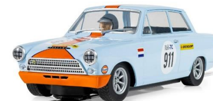
C4669 Ford Lotus Cortina #91 Gulf