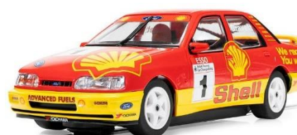
C4632 Ford Sierra Sapphire #1 BTCC 1990