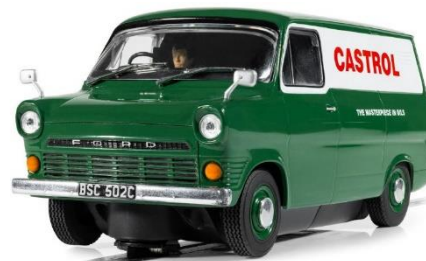
C4648 Ford Transit MK1 Castrol