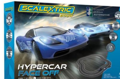
C1464 START Hypercar Face Off Set