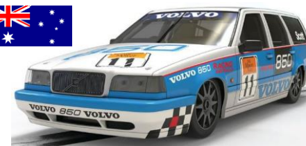
C4688 850 Estate #11 1995 Scott