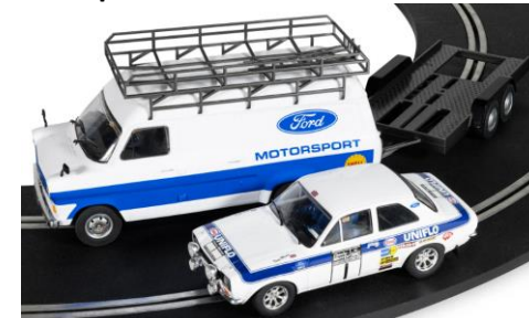
C4649A Ford Transit Escort Twin Pack