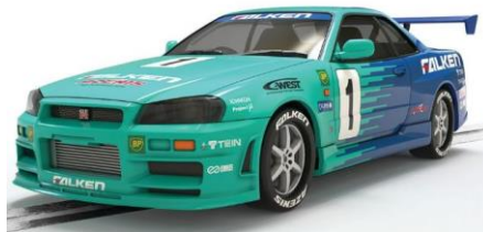
C4678 Nissan R34 GT-R #1 Falken Tyres