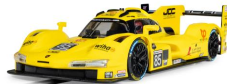
C4653 Porsche 963 #85 Daytona 24hr '25