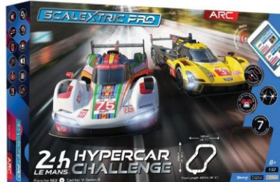
C1466 Pro 24hr Le Mans Hypercar Set