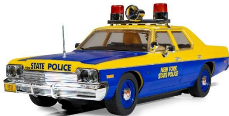
C4636 Dodge Monaco Police Edition