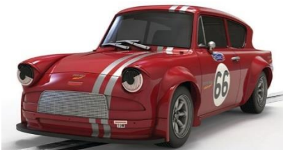
C4691 Ford Anglia #66 CSCC