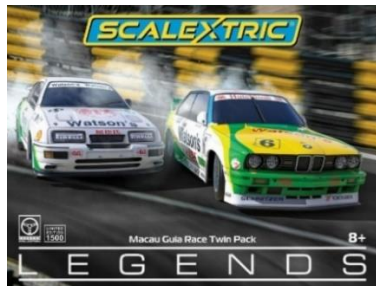
C4670A Macau Guia Race Twin Pack