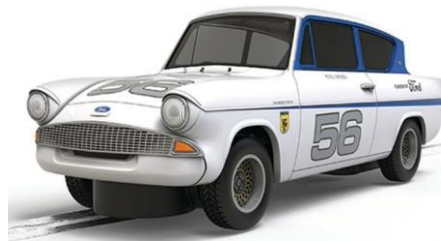
C4682 Ford Anglia #56